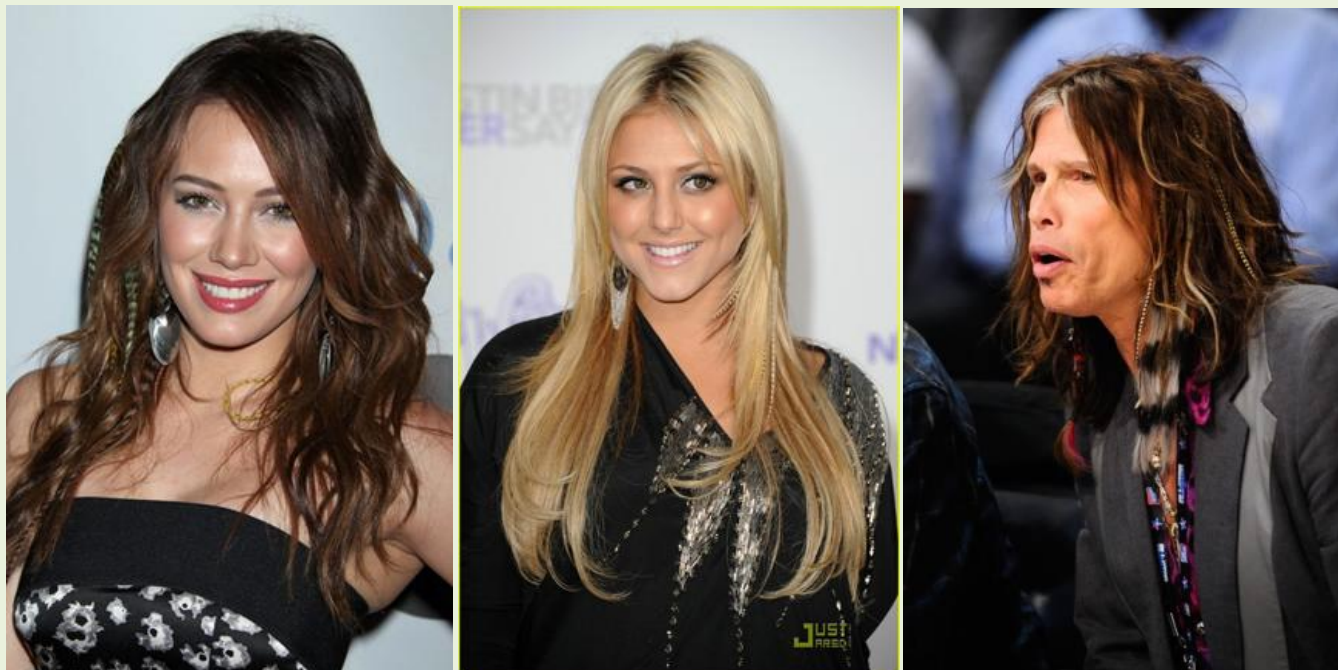
Hilary Duff, Cassie Scerbo, and Steven Tyler wearing feather extensions

Expressing your fun side and being fashionable is what rocking feathers is all about. If you haven't noticed, the peacock has made a comeback and can be seen throughout the fashion industry. The trend of weaving feathers into hair started in California. But since celebrities, notably Steven Tyler on "American Idol," started sporting the long feathers in their hair, the style has arrived here in the south as well. So go and add some extra flair to your wardrobe and shake a tail feather.